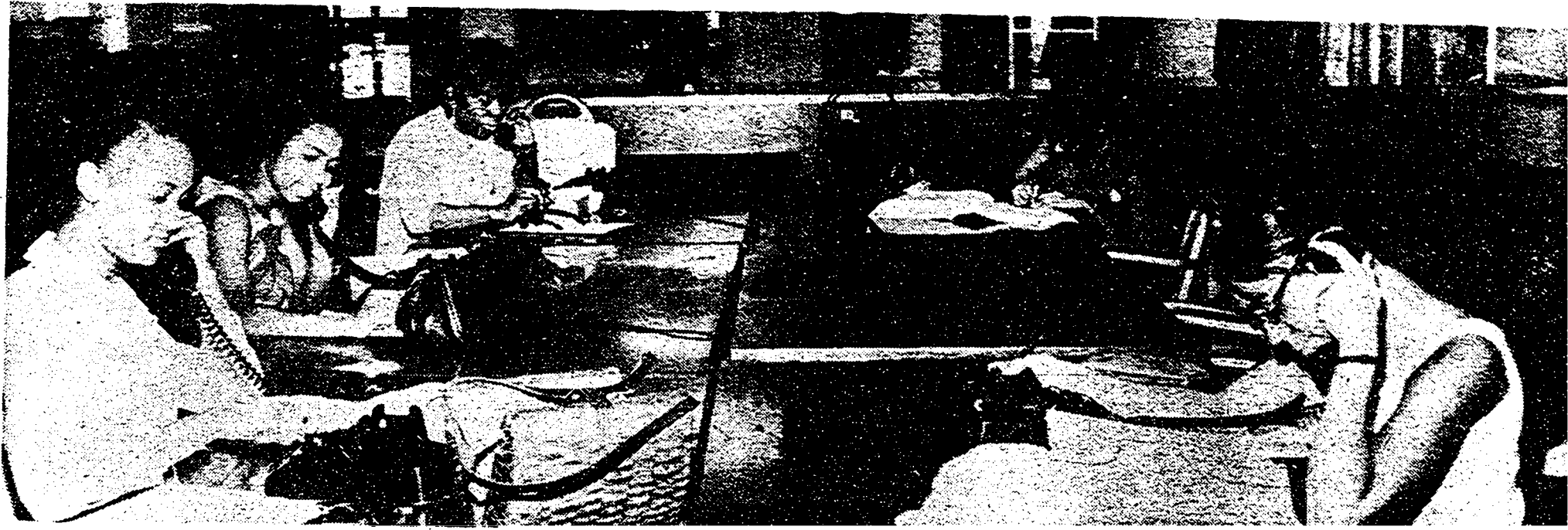
The first group of "Keep A Cool Summer" Boosters man telephones after the Daily Defender opened its Booster Headquarters Saturday, June 10.