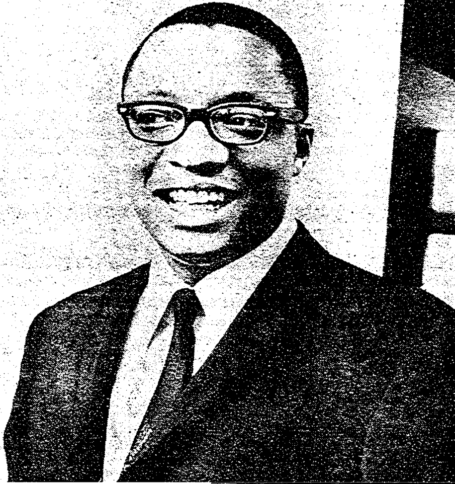
Far and away, the star of the day was Cadet Records' jazz star Ramsey Lewis. Currently appearing with his trio in the London House, Lewis

At least once weekly during the "Keep A Cool Summer" campaign, volunteers will set up displays at one or more shopping centers in Chicago, where shoppers will be asked to sign up, thus giving the drive their moral support.